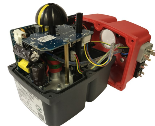
J3C-S with digital positioner installed

For those critical applications where the actuator needs to set the valve in a pre-determined 'safe' position on either loss of control signal OR on loss of external power, failsafe modulating functionality is required. In the J3C-S this is effortlessly achieved by us simply installing inside the actuator both the battery failsafe system and the digital modulating system.