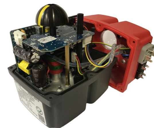
J3C-S with digital positioner installed

For those critical applications where the actuator needs to set the valve in a pre-determined 'safe' position on either loss of control signal OR on loss of external power, failsafe modulating functionality is required. In the J3C-S this is effortlessly achieved by us simply installing inside the actuator both the battery failsafe system and the digital modulating system.